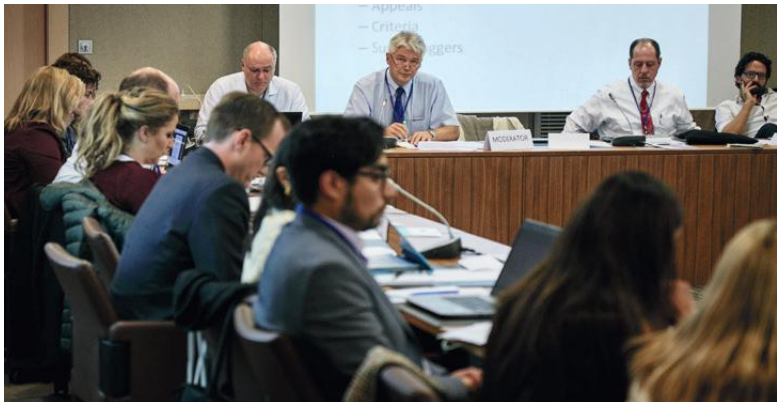
The 2016 Global Internet and Jurisdiction Conference was held at the Ministerial Conference Center in Paris, provided by the French Ministry of Foreign Affairs.